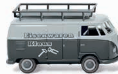
0788 03 VW T1 (Type 2) van