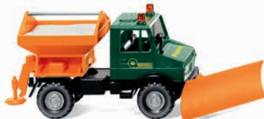
0646 08 Winter service – Unimog U 1300