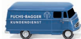
0265 03 Van (MB L 319)