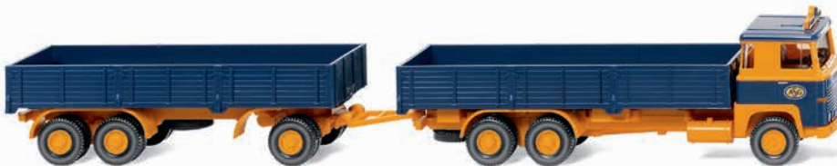
0433 04 Flat-bed road train (Scania 111)