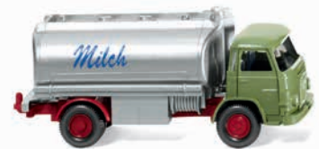
0807 48 Milk float (MAN 415)

W IKING celebrates the premiere of the new generation of the MB E-Class with a closed-roof version. The Volvo Amazon as four-door and the legendary VW 411 as fire brigade vehicle also make their debut. WIKING introduces a sophisticated new development with the multi-functional Fuchs cable excavator F 301, which thanks to its versatile movability, carries all values of its original in 1:87 scale. The MAN 415 as milk float, the timber transporter with Magirus S3500 tractor unit and the MAN all-wheel drive tanker, whose German