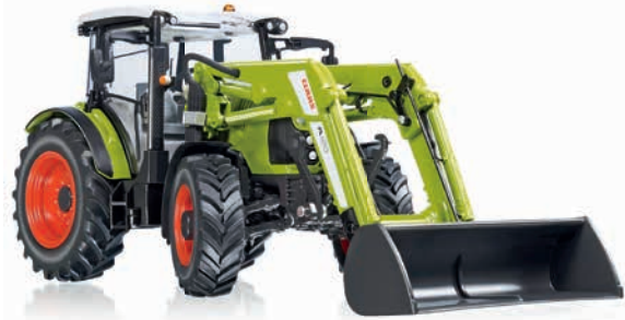
0778 29 Claas Arion 430 with front loader 120