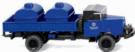
0693 28 THW - standby tanker (MAN)