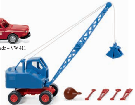
0662 01 Cable excavator (Fuchs F 301)