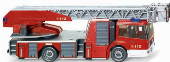
0627 04 Fire brigade – Metz DL 32 (MB Eonic)

Topicality on all 1:87 construction sites: The imposing Volvo wheel loader L 350F as well as the Atlas mobile excavator 2205 M join the programme. Both specialists achieve a high degree of model making original authenticity through fully functional loading movements. Moreover, fire brigade enthusiasts will be pleased with the Metz turntable ladder DL 32, which mounted on the low-floor chassis of the Mercedes-Benz Eonic is equipped for every rescue mission. The Unimog U 1300 is ready for winter service on the haulage premises of