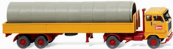
0515 01 Aluminium flat-bed lorry (Volvo F88)