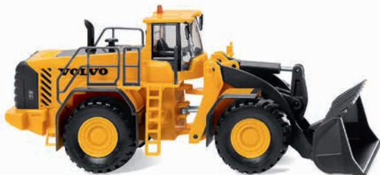
0652 02 Wheel loader (Volvo L 350F)