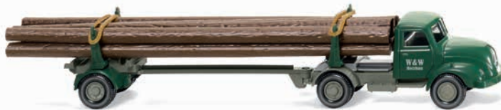
0390 10 Timber transporter (Magirus S 3500)