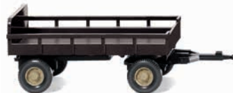
0869 03 Agricultural trailer