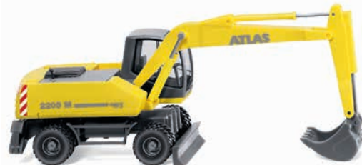
0661 03 Mobile excavator (Atlas 2205 M)